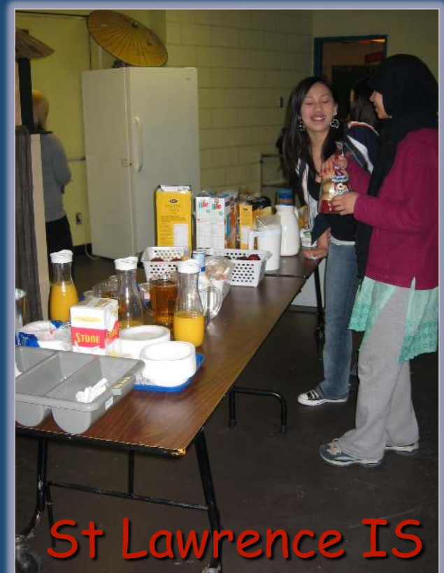
St Lawrence IS