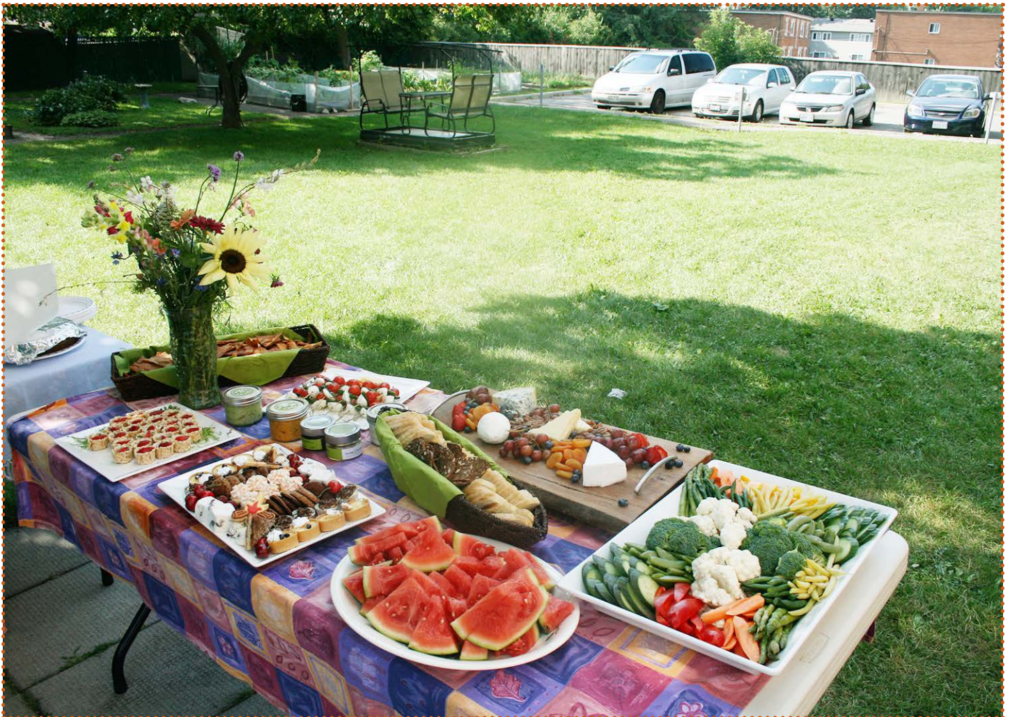
Organic fruit, veggies, and canapés were enjoyed by all at the Recognition Event on August 19th, 2016.