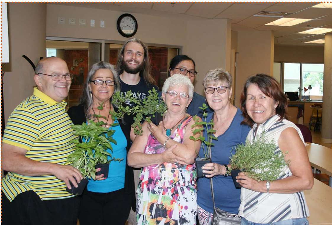
Aboriginal seniors and Team Lead, at Wabano, enjoying a workshop on herbs.

Horticultural workshops were carried out at Wabano and Odawa with great success. We covered topics such as plant medicines, therapeutic and culinary herbs representing the mint family, roses (and the fascinating history of the medicinal uses of rose essential oil), baking with herbs, and plant breeding and the evolution of plant cultivars. SOG also provided many plants to the seniors for their own personal gardens. The seniors' circles gathered with such enthusiasm at both Wabano and Odawa; in many ways, the plant kingdom is connected to Aboriginal cultures and ways of life.