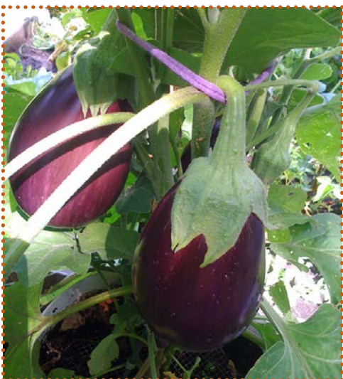
Eggplants growing in gardens at 800 St. Laurent OCH, almost ready for harvest.

The success of the summer SOG program culminated in our recognition event, which was held on August 19th, 2016. The event was a garden party, held on a beautiful summers' day, at the 800 St. Laurent OCH gardens. Our purpose was to acknowledge and thank our generous grantors – the Community Foundation of Ottawa – as well as our other donors, and to celebrate the gardening program with its participants – the seniors.