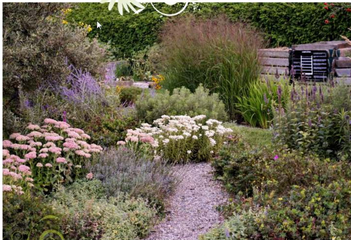
White Pearly Everlasting in the front bed.